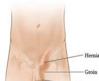
Figure 2: Position of left inguinal hernia

You should no longer have a hernia. Surgery should prevent the serious complications that a hernia can cause and allow you to return to normal activities.