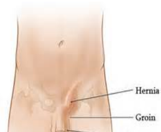
Figure 2: Position of left inguinal hernia

You should no longer have a hernia. Surgery should prevent the serious complications that a hernia can cause and allow you to return to normal activities.